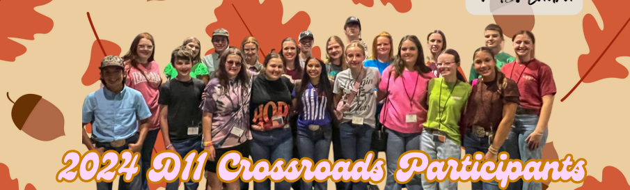
2024 D11 Crossroads Participants