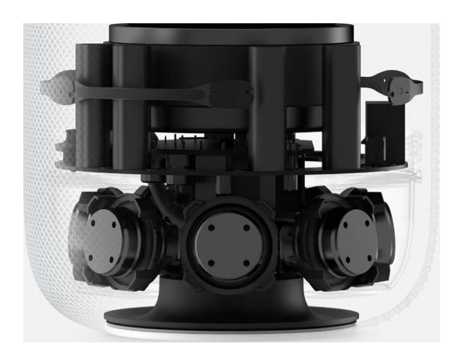
Figure 7: Speakers arranged in a circular design

Wattage (W) is a feature that many speakers use within their marketing strategy. However, wattage is a power unit of measure. The true measure of speaker power is a combination of speaker rating (wattage), power of the amplifier, and efficiency between the two. Two models boasting 40W of sound may not necessarily be equally loud. Since you can't know the specs of the internal amplifier nor the speaker's efficiency, that would be like buying two jelly-filled donuts without knowing what filling was used. They just will not be the same. Also know that reference to wattage may not be specific to the speaker. You may see a 40W speaker, a 40W amp, or 40W of sound as a marketed feature.