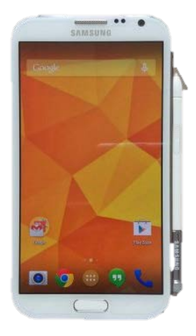
Figure 3: [Phablet] Samsung Galaxy Note (Released October 2011)

• Phablet – This type of tablet gets its name from "smartphone" and "tablet" as a crossover between the smaller smartphone and the functional attributes of tablets. This type is also known as a hybrid. With screens in the 5-inch range, the typical phablet is around 5.5 inches. These tablets are designed for screen-intensive interaction with many having or including a stylus typically stored within the frame of the device for notetaking or sketching. These devices are typically used for mobile web browsing and multimedia viewing and like smartphones include a touchscreen interface. As the size of smartphones increases to even larger models than the phablet, what differentiates a phablet from a large smartphone is the 16:9 aspect ratio unique to the phablet. Some smartphones may be "longer" than the phablet and do not hold to the 16:9 aspect ratio.