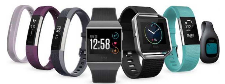
Figure 6: Fitness Trackers

The term "tracker" implies that it is monitoring or following your physical activity. While some believe that a tracker might improve your physical fitness, the reality is that it does not affect anyone's physical activity directly but only indirectly by the information it provides the user. However, that information can be extremely useful and helpful to the user by monitoring progress to their own specific goals. They can also provide motivational support in the form of challenges, interaction with online friends, and alerts when "it is time to get up." However, like a gym membership, it only provides that information if you use it.