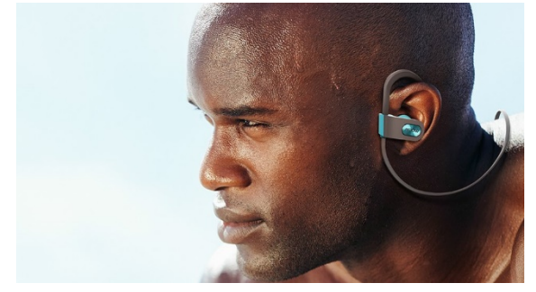
Figure 4: Ear-Hook Design

Many of these models also come with a wide range of designs to hold the earbud in place. For many, simply putting them in the ear as shows in Figure 3 is enough for them to stay in place. However, depending on the level of activity, "ear hooks" may be needed to keep them in place. There are a wide range of products available for the active listener that wants to listen while they work out, play sports, or do anything that may need to provide some support and keep them in place.