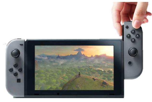
Figure 5: [Gaming] Nintendo Switch (Released March 2017)

• Others – As the evolution of tablets continued to find unique consumer demands, other forms of tablets were developed. While less common now, there still exist other forms of tablets that target gamers. Gaming tablets may include peripheral devices that interface a much more functional gamepad or thumbstick to provide a better gaming experience for the user. Other designs included the booklet or clamshell designs that include an integrated gamepad or thumbstick. These are designed specifically for gaming experiences and are less functional when it comes to web browsing, multimedia viewing, apps or other diverse uses.