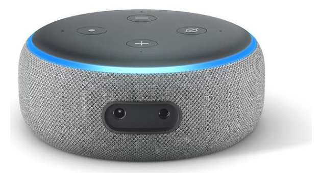
Figure 8: Smart Speaker with Voice Control

Some of these devices may be accessed via Bluetooth, WiFi, or both and may extend functionality of the speaker beyond playing sound (music) by accessing/controlling automated functions with integrated controllers.