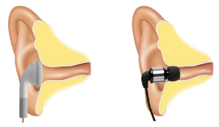
Figure 3: Earbuds vs. In-Ear

Some listeners may find these types of headphones uncomfortable if used for long periods of time. Consider the comfort level and time they will be used before making your purchase.