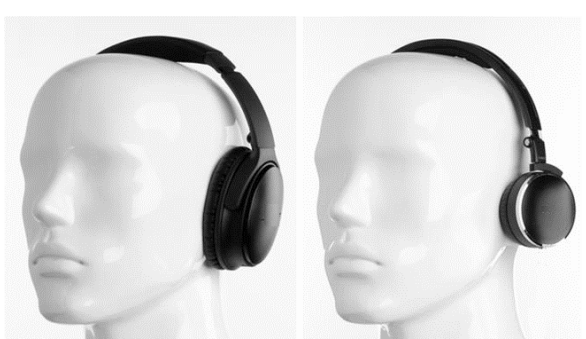
Figure 2: Over-ear (L) & On-ear (R) Models

This style of headphone generally is smaller and lighter than its over-ear sibling. These models press directly over the outer ear instead of the head. Many consumers find them more comfortable than the over-ear models. Similarly, these headphones come in closed-back and open-back styles in order to create the same effects. However, since they only go directly over the ear and do not press against the head, they are much more likely to bleed sound out and let ambient noise in as compared to the over-ear headphones. This is primarily because by nature of them sitting on the ear, they do not create a seal against the head. Depending on the size/shape of the user's ears, these headphones can vary greatly in this regard.