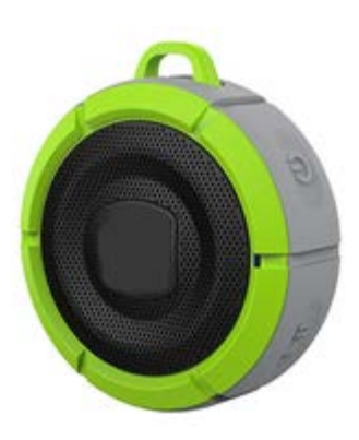
Figure 6: Unidirectional Wireless Model