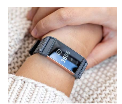
Figure 7: All-Day Fitness Tracker

Consumer Reports identifies two types of fitness trackers, the All-Day and the Training models. A third model has surfaced lately adding a new dimension to this growing market, the Ring tracker. Allow of these are similar in function while the latter two are wrist-worn, the new finger-worn models are included in this category of products.