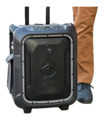
Figure 4: [Tailgater] 29 lbs & 12" x 15" x 20"

Without question, between these two examples, there would be a considerable weight difference. Depending on its use and application, weight can be a significant factor in determining the best model for the consumer. The smallest models could weigh only a few ounces, while the larger models could weigh up to or over 20 pounds.