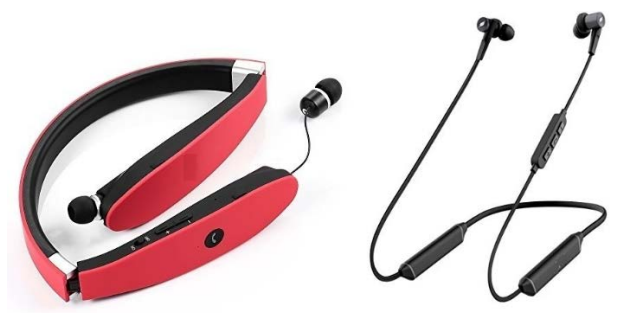
Figure 5: Rigid and Soft Collar-Style In-Ear Headphones

Within the in-ear/earbud models exist some that include a rigid or soft collar that lays around the neck with wired earbud/in-ear headphones. These styles can be foldable and may be easier to store than their larger over-the-head siblings.