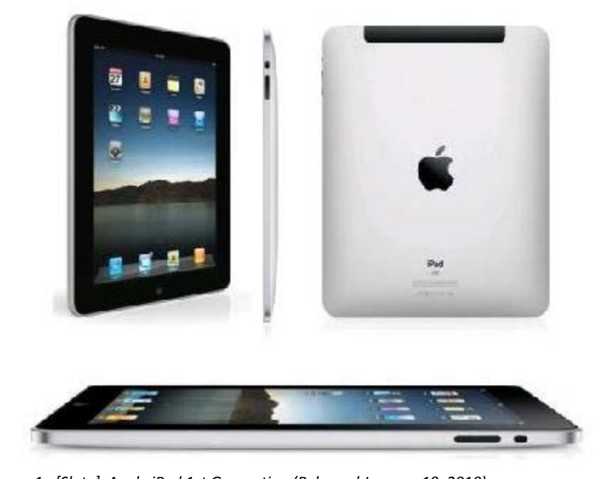
Figure 1: [Slate] Apple iPad 1st Generation (Released January 10, 2010)

• Slate – This type of tablet is typically in the smaller range of tablets. Their screen sizes can be as small as 5 to 6 inches, a bit below the standard 7 to 10-inch range for tablets. However, some slate tablets can be as large as 10 inches. The primary feature, or lack thereof, is that slate tablets do not come with a keyboard. Although you can typically add a keyboard as an accessory, the slate tablets are small, sleek, and are designed primarily for touchscreen interface (including on-screen keyboards) for accessing entertainment apps, watching videos or playing games that use the touchscreen interface. The touchscreen can be used using the finger(s) or even a stylus (likely not included at the time of purchase).