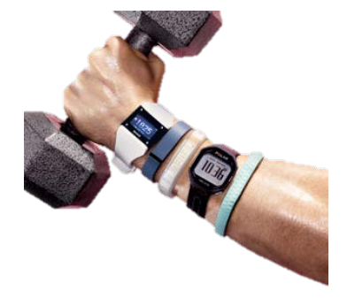
Figure 8: Training Fitness Tracker