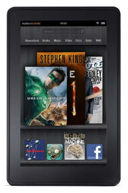
Figure 2: [Mini] Kindle Fire 1st Generation (Released November 2011)

• Phablet – This type of tablet gets its name from "smartphone" and "tablet" as a crossover between the smaller smartphone and the functional attributes of tablets. This type is also known as a hybrid. With screens in the 5-inch range, the typical phablet is around 5.5 inches. These tablets are designed for screen-intensive interaction with many having or including a stylus typically stored within the frame of the device for notetaking or sketching. These devices are typically used for mobile web browsing and multimedia viewing and like smartphones include a touchscreen interface. As the size of smartphones increases to even larger models than the phablet, what differentiates a phablet from a large smartphone is the 16:9 aspect ratio unique to the phablet. Some smartphones may be "longer" than the phablet and do not hold to the 16:9 aspect ratio.