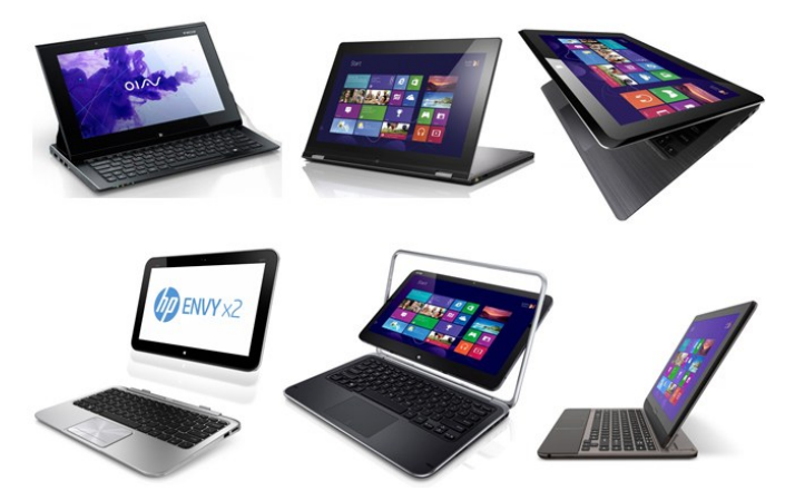
Figure 4: [Laplet] Convertible & Detachable Models

• Others – As the evolution of tablets continued to find unique consumer demands, other forms of tablets were developed. While less common now, there still exist other forms of tablets that target gamers. Gaming tablets may include peripheral devices that interface a much more functional gamepad or thumbstick to provide a better gaming experience for the user. Other designs included the booklet or clamshell designs that include an integrated gamepad or thumbstick. These are designed specifically for gaming experiences and are less functional when it comes to web browsing, multimedia viewing, apps or other diverse uses.