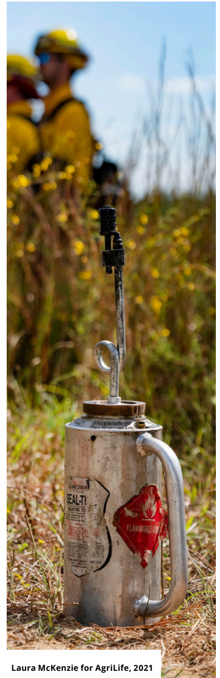
Laura McKenzie for AgriLife, 2021

4 Prescribed burning keeps rangelands healthy, productive, and more resilient to future challenges. This study underscores that conservation isn't passive—it's an active process rooted in understanding disturbance, resilience, and renewal. Prescribed fire is not just a restoration tool, but a proactive strategy for keeping grasslands healthy, productive, and diverse. Long-term fire planning supports soil function, forage stability, and ecosystem balance—ensuring that rangelands can continue to provide food, wildlife habitat, and fire protection well into the future.