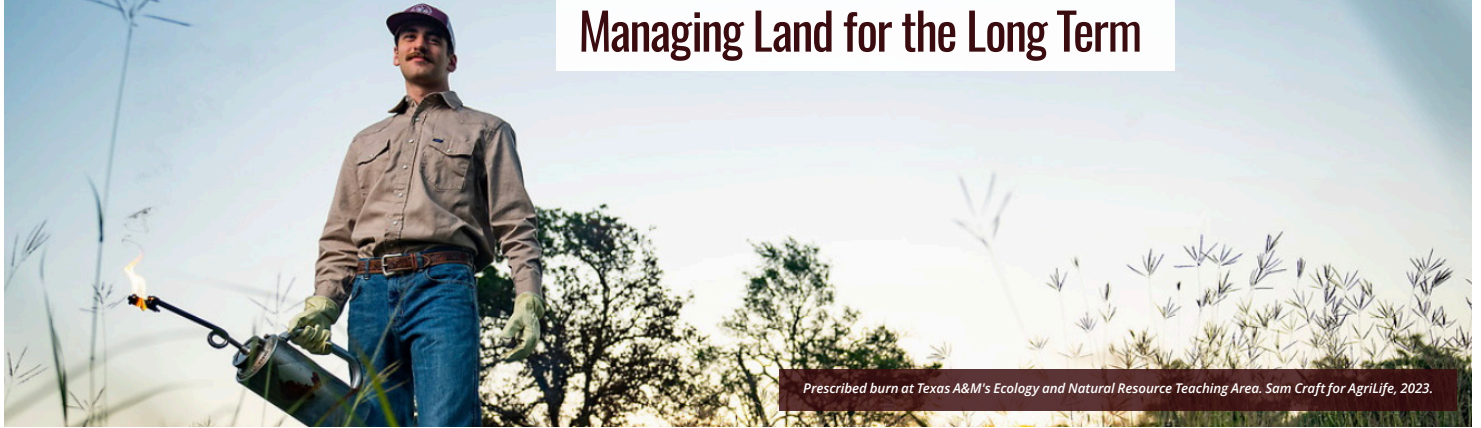
Prescribed burn at Texas A&M's Ecology and Natural Resource Teaching Area.