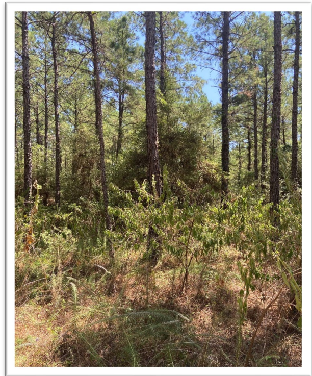
Representative fuels near the incident site

When TAMFS resources were requested to assist local fire departments on the Snow Hill Fire in San Jacinto County on August 2, they arrived to find approximately 10 acres burning with moderate to high fire behavior in a thinned loblolly pine plantation with the potential for rapid growth and threats to homes. Given the time of day (approximately 13:30), conditions, and potential of the fire, more resources were ordered, including additional dozer and tractor plow units, engines, and aviation resources. There was already an ambulance on scene that came with one of the local fire departments, but an Emergency Medical Task Force (EMTF) that was staged in Jasper, approximately 90 miles away, was also requested due to the potential for heat related injuries for responders. Some of the additional resources ordered included two tractor plow units from the nearby TAMFS office in Huntsville. Tractor Plow 1 was staffed with an Initial Attack Tractor Plow Operator (TPIA) and a Firefighter Type 2 (FFT2) as a swamper. Tractor Plow 2 was staffed with Noah, a qualified TPIA, Jack, also a TPIA and Heavy Equipment Boss (HEQB), and Dylan, a FFT2.