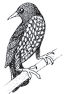
Figure 2. Starling.

Starlings are smaller than grackles (about the size of a robin) and have short, square tails. During the winter adult starlings are speckled with light dots, but they become more iridescent and less speckled during the breeding season. Juvenile starlings are a dusky, gray color.