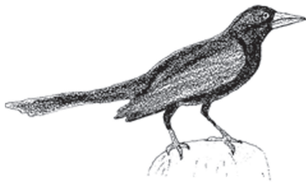
Figure 1. Common Grackle.

These large blackbirds are characterized by long, keel-shaped tails and yellow eyes. Male grackles often appear iridescent purple. They are about the size of a small crow and are very common in Texas. Grackles are frequently seen feeding in fields, lawns, golf courses and orchards. They nest wherever there is adequate cover such as trees in parks, yards, woodlots, orchards and marshes. Grackles are omnivorous, which means they feed on a variety of plant and animal matter. Insects make up the bulk of their diet during the spring and summer