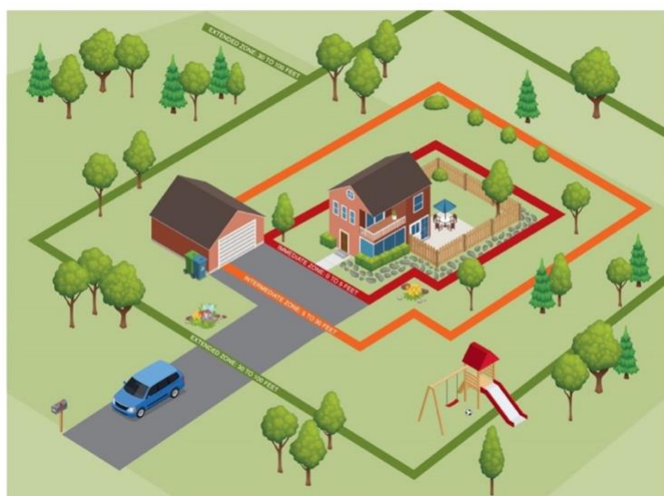
Figure 1. Experiments, models and post-fire studies have shown homes ignite due to the condition of the home and everything around it, up to 200' from the foundation. This is called the Home Ignition Zone (HIZ). Concepts adopted from Firewise USA®.

Home Ignition Zone (HIZ) (Figure 1). Even though these recommendations were developed for homes, the same approach can be applied to barns, shops and other outbuildings.