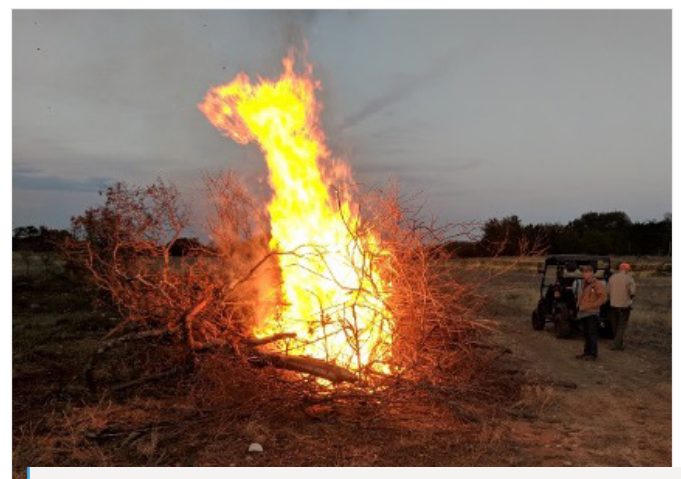
Burning smaller brush piles reduces the risk of fire escapes while still burning faster than large piles.

When chaining or grubbing standing brush, it is often convenient to make large windrows of piled plant debris. While this may be an easy solution on the tractor or bulldozer, it can be a major safety and liability issue when it comes time to burn it. Brush piles are best built small and dense—picture a small car versus a greyhound bus—which allows fire to guickly spread throughout the pile, increasing its intensity. As a result, this reduces the time it takes to burn and shortens the time that the pile is emitting and lofting firebrands and embers into the air. Small and compact brush piles will reduce the overall intensity of the burn, the size of the flame, and the amount of smoke produced, making the pile much more manageable on burn days. Even though building many small brush piles adds more piles to burn, it makes the process more manageable while minimizing the risk of a wildfire and allowing for better smoke management, which should be a priority (Oklahoma Cooperative Extension Service, 2017). Therefore, when building brush piles, be sure to plan ahead for potential ignition. Look up, look down, and look around for potential hazards and flammable material.