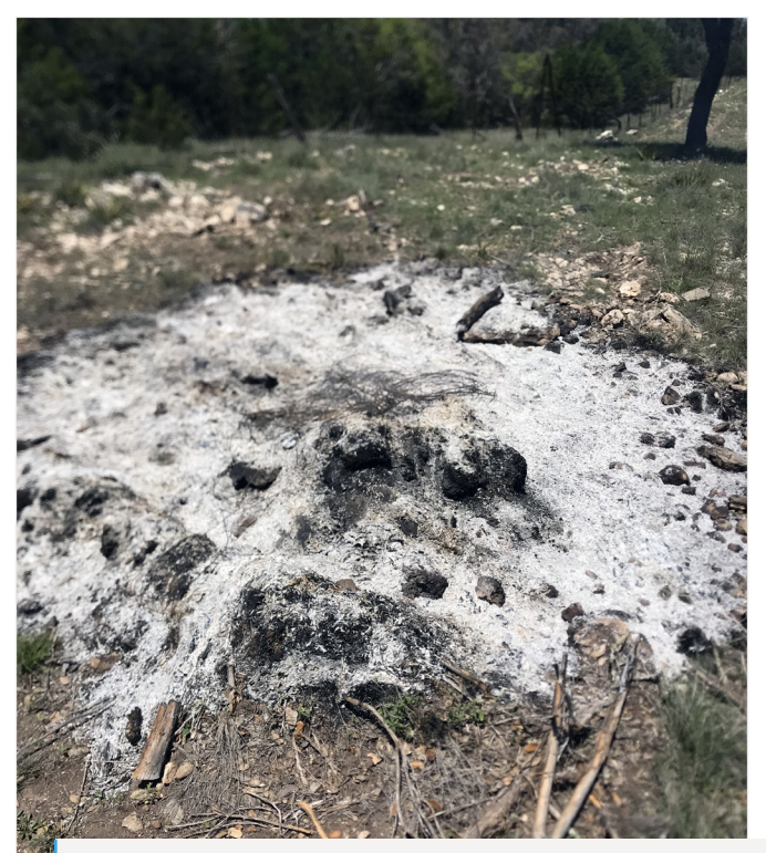
Once the fire is extinguished, there may be a residual fire scar left on the ground. While potentially unsightly, these scars will naturally be reclaimed by grasses and forbs in upcoming years with adequate rainfall and rest.

Once the fire is extinguished, there may be a residual fire scar left on the ground. While potentially unsightly, these scars will naturally be reclaimed by grasses and forbs in upcoming years with adequate rainfall and rest. Brush pile scars on the soil's surface can be mitigated by the season of burn, such as during periods of high fuel moisture content or relative humidity. Keep in mind the need for smoke management and dispersion, as well as increased time for complete combustion of the brush pile. Brush pile scars or more areas with bare ground following the brush pile burn are temporary and will create an opportunity for different plants to become established, such as forbs and secondary- succession plant species. Plant succession will eventually attract certain species of