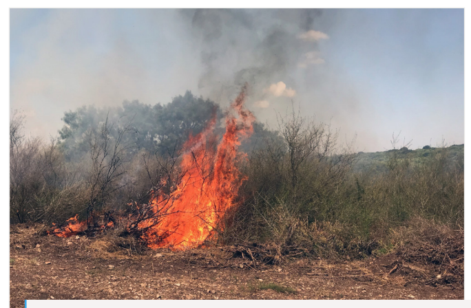
Brush piles should be contained with a bladed line down to bare mineral soil in order to prevent any escapes through adjacent fine fuel, such as dormant grass.

Once the attainment status of the burn location is determined, that will allow a person to identify which types of materials may be burned.