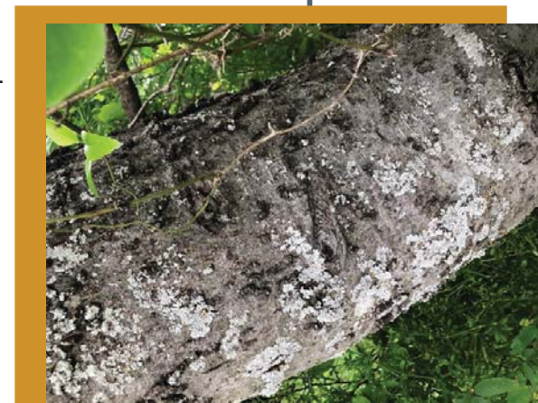
Warty trunk of the sugarberry

In addition to growing in straight lines along fences past and present, Sugarberry is often found growing along the streams and rivers of the Cross Timbers. It can tolerate a wide range of annual rainfall, anything from 20-80 inches per year, and grows in a wide variety of soils. Those aptly named sugary berries are consumed and subsequently spread by a wide variety of birds.