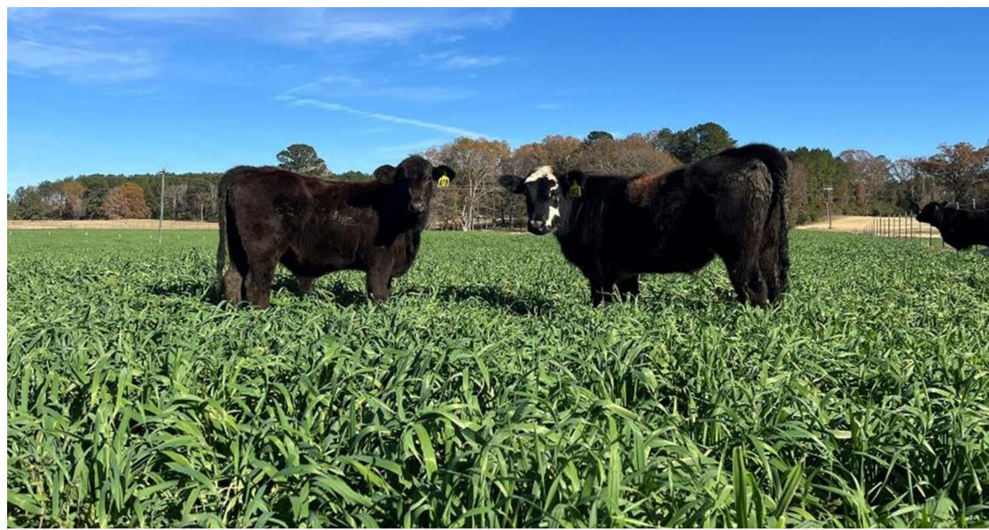
Figure 1: Cattle Grazing 'Bob' oats

This study was conducted to evaluate animal performance and economic impact on the grazing of three cool-season monocultures.