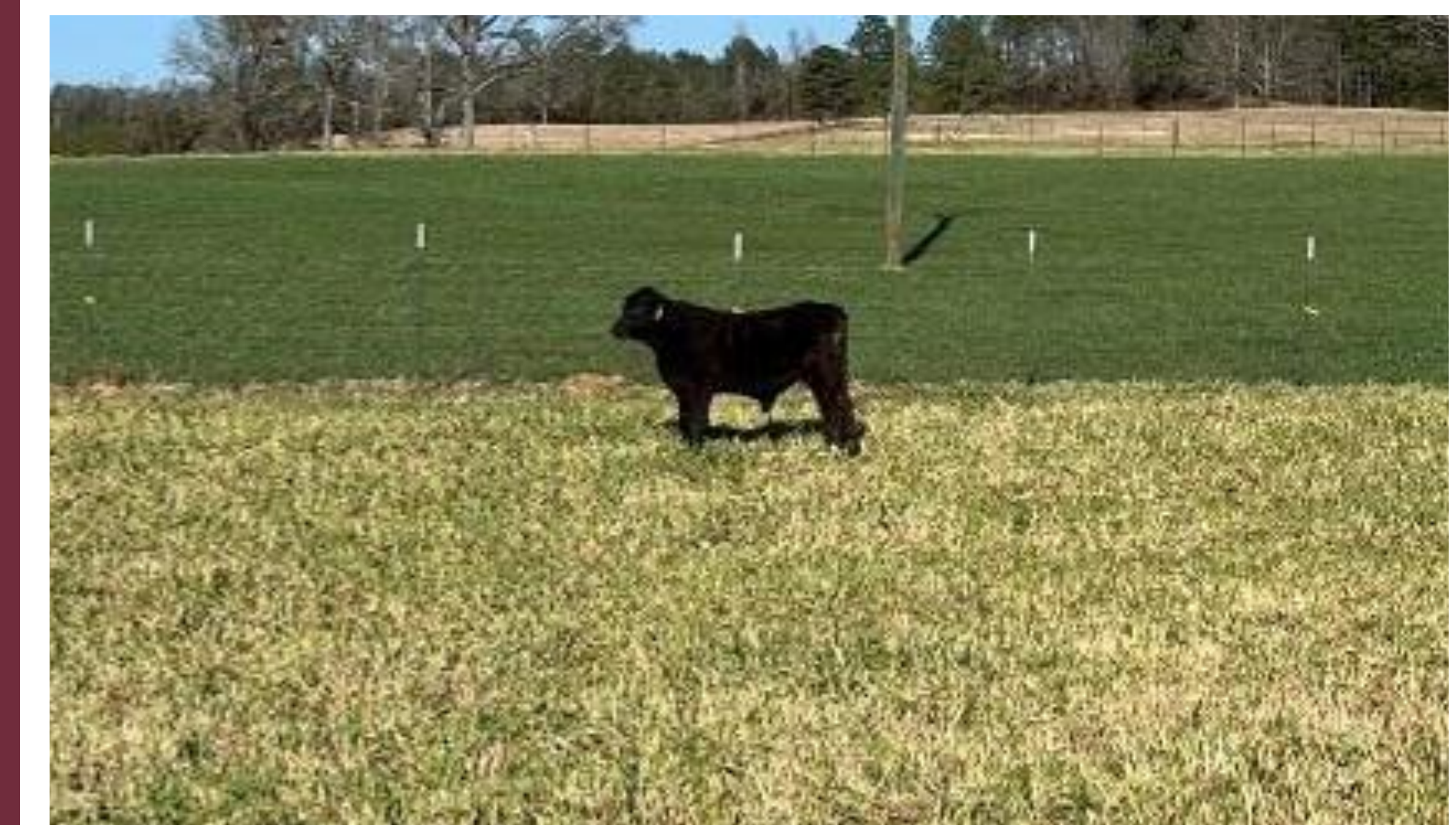
Figure 2: Steer grazing post-freeze conditions of 'Bob' oats