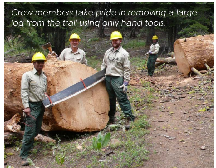
Crew members take pride in removing a large log from the trail using only hand tools.