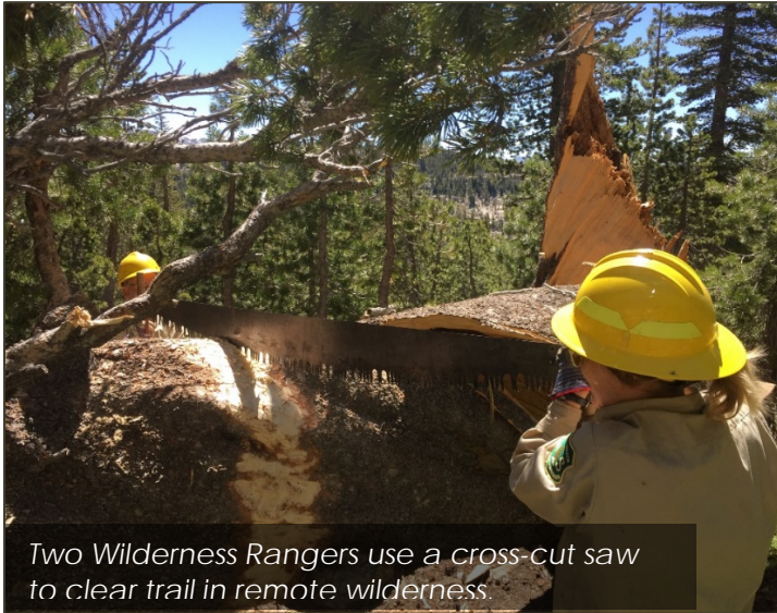
Two Wilderness Rangers use a cross-cut saw to clear trail in remote wilderness.