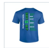
Gildan 5000 Heavy Cotton T-Shirt

We have only had a few responses and not enough to do an order yet. Please respond by January 8th.