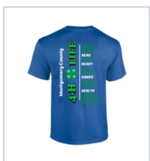
Gildan 5000 Heavy Cotton T-Shirt

If we get enough responses, we will open up a second order.