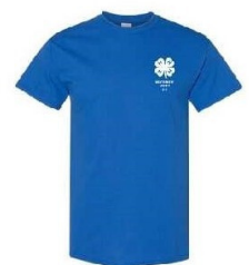
Gildan 5000 Heavy Cotton T-Shirt