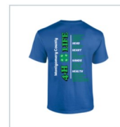
Gildan 5000 Heavy Cotton T-Shirt