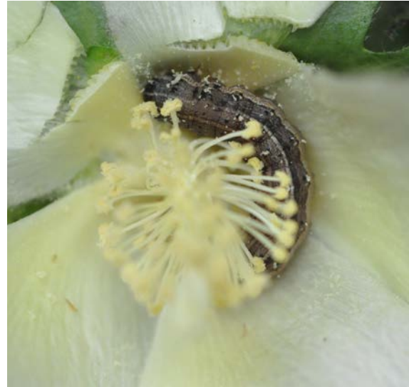
Fall armyworms can often be found feeding in bloom of Bt and non-Bt cotton

Although rare, the rice strain has been observed dispersing as larvae from pasture into cotton where they fed exclusively on grassy weeds. The corn strain, however, can be extremely damaging. Fall armyworms that feed on cotton are typically more damaging than other armyworm species infesting cotton because they have a greater propensity to feed upon fruiting structures. However, they do not appear to be as voracious of fruit feeders as bollworms. When abundant in pre-bloom cotton, fall armyworms may cause defoliation but the greatest damage comes from the topping off plants. Branches may be cut off and sometimes the stalks may almost be completely severed. The most damaging populations of fall armyworms are those that occur during boll filling. Because fall armyworms tend to quickly disperse away from the egg mass, and because the egg masses are often laid inside the plant canopy, it is not uncommon to find small larvae individually feeding on squares and bolls much like a bollworm. Also, similar to bollworms, it is not unusual to find small larvae feeding under bloom tags. Because they exhibit a cryptic feeding behavior similar to that of bollworms, they are easy to miss and often become most evident when observed feeding in blooms.