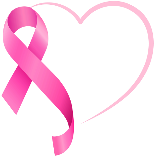
Breast Cancer Awareness Month