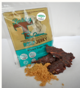
Brown Sugar BBQ