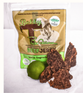
Sagrado Hatch Chile

HELP BEEF UP TEXAS 4-H | INVEST IN YOUR LOCAL 4-H PROGRAMS