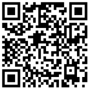
Presurvey QR Code