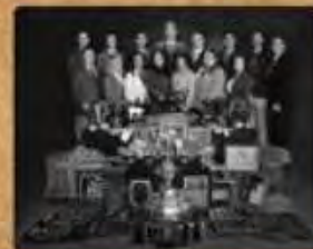
2013 National Champions