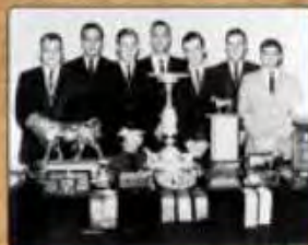
1967 National Champions