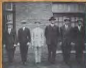
1913 International Champions