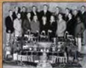
2004 National Champions