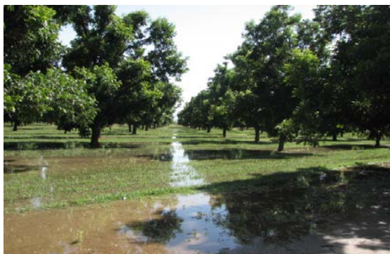
Flood irrigation is common in the region due to soil salinity

Support provided by: US Bureau of Reclamation, USDOl; USDA-NIFA, Rio Grande Basin Initiative through Texas Water Resources Institute and Texas A&M AgriLife Research in collaboration with the local growers