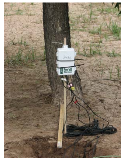
Example of a soil moisture sensor installed in the field

Results indicated that while all three sensors were successful in following the general trends of soil moisture conditions during the growing season. Accuracy of measurements by tensiometer was relatively greater than that of ECH2O 5TE and Watermark. Sensors data showed that in all irrigation events the soil moisture content was well above the threshold level, indicating that excess water was applied by conventional method. Results indicate that one to three irrigations could be saved per season by irrigating fields based on soil moisture data. With an estimated 12,000 acres under irrigated pecan production in El Paso County Water Improvement District #1, each irrigation saved translates into 3000 to 6000 acre-feet for freshwater savings. The results of this study can help in improving water use efficiency in pecan orchards, conserve precious freshwater resources and increase farm profits.