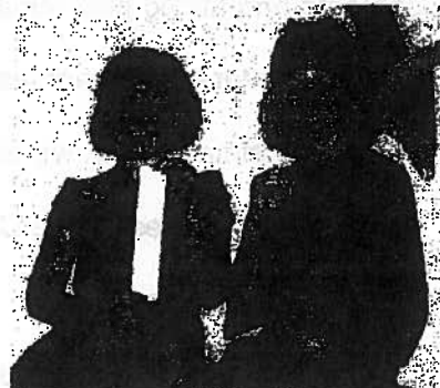
My sister and I placed at District Food Show.

Besides my lambs, I also started my Foods and Nutrition project last summer by going to Food Camp. It was a lot of fun; we learned a lot of different things and new recipes, and the number one rule is you have to try everything once. The last day of the camp, we had a meal for everyone to come and try all of the recipes we had learned to make. I learned how to measure liquids and solids in measuring cups and spoons and