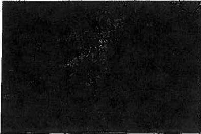
Moving lambs into Houston stock show.

good way to tell if they are all feeling and doing well. I can always tell if one of them is not feeling good. Caring for show lambs is never boring. Besides the usual of feeding and watering and cleaning water buckets, we also have to train them to show and walk for judging. We have to take care when we tie them to a fence too.