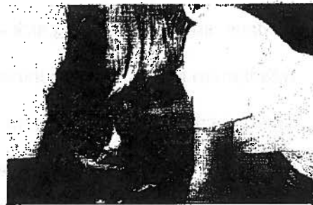
My Dad, sister and I giving shots to show lambs.

When it is time to give shots, dad is teaching me how to draw liquid medicines into a syringe and use proper needles. This is not as easy as it looks. If you have ever been at the doctor's office and had to get a shot and see a nurse or doctor get shots ready. They make it look easy. My dad does it so easy and I hope I can do it that easy someday. Using the right size needle for the right size syringe and animal is also very important. You do not use the same size syringe and needle for a lamb that you use for a cow or horse. Also, some medicines are thicker than some to and will not come out of real small needles. When we give shots, dad makes me read the label to see how to give the medicine. Some medicine you can give orally, some by in the muscle and some you have to give under the skin. We never give shots on the rump or back and never on the "show side" either. Right now, dad still gives the shots to our animals, but my sister and I have to hold them for him. We hold our lambs on the ground or when they get older we hold their head and