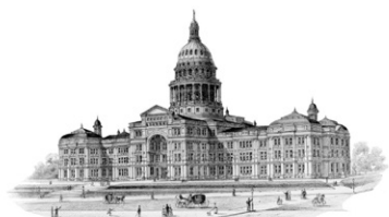
STATE PRESERVATION BOARD

The Texas State Preservation Board in partnership with the Texas 4-H and Youth Development Program are pleased to present an annual photography contest for members of the Texas 4-H and FFA Programs. This photography contest allows 4-H and FFA members to showcase Texas Agriculture through photos.