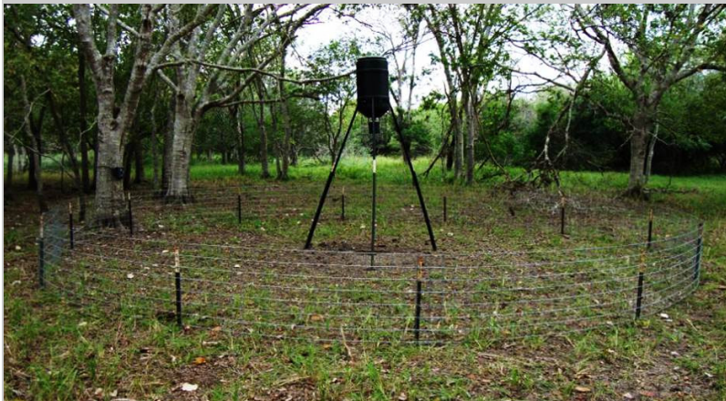
Exclusionary fences such as this can keep wild pigs away from supplemental feed sites while still allowing deer access.

With more than 300 million pounds of corn being distributed each year in Texas, unprotected supplemental feed sites could be providing a stable food source for many wild pigs. This could lead to a result contradictory to which feeders are intended. While the intent is to attract deer and other native wildlife, supplemental feed sites can instead attract pigs which in turn displace the deer. Not only is this negative to deer and native wildlife, the cost of feed that does not even reach its intended purpose is an unnecessary expense for wildlife managers. If feeders are being used, the use of exclusionary devices or species-specific feeders may help reduce competition between wild pigs and deer (Schlichting et al. 2015).