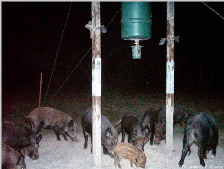
Wild pigs are able to exclude deer from supplemental resources and natural foraging areas, leaving deer with fewer food options.

to see how wild pigs can potentially outcompete deer and other native wildlife for resources.