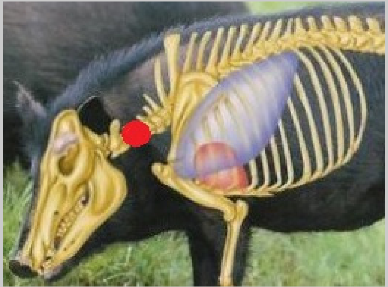
Figure 2. Shot placement directly behind the ear (red circle) of a broadside wild pig is a good choice for ethical harvest and quick recovery in the field.

are generally still lethal. However, shot placement directly behind the ear of a broadside animal is often a better choice in making both an ethical harvest and quick recovery (Figure 2).