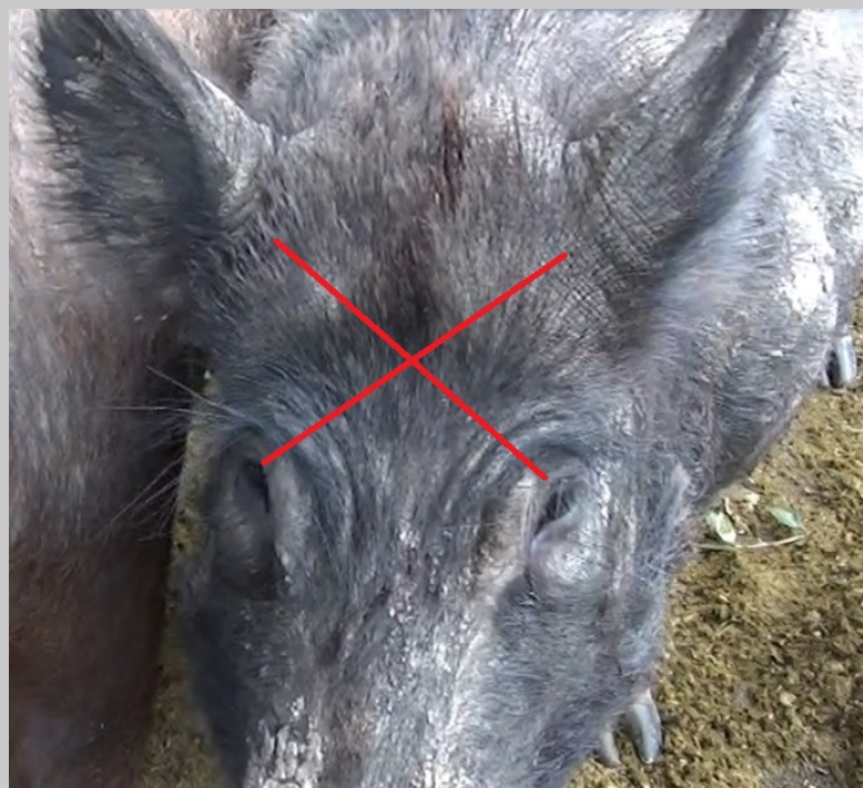
Figure 3. To ensure a proper brain cavity shot, draw an imaginary line from each ear to the opposing eye of a wild pig. The shot can then be placed at the intersection of the two lines.