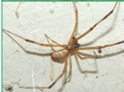
Figure 10. Female widow spider (top), male widow (bottom).

piles, garages, cellars, shrubbery, crawl spaces, rain spouts, termite bait stations, gas and electric meters, and other rarely disturbed places.