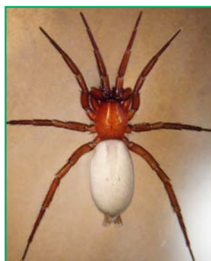
Figure 1. Ground spider showing cephalothorax, abdomen and eight legs.

The spinnerets and a distinct abdomen distinguish spiders from the other arachnids.