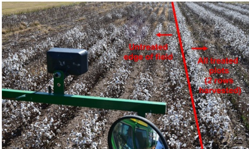
Figure 3. Kiowa County irrigated trial at harvest, Nov 1.

Ultimately, lint yield was significantly improved by flutriafol application. The 0.26 lb/acre rate resulted in significantly higher yield than the 0.13 lb/acre rate and the Topguard product resulted in greater yield than CHA-1328. Application method had no effect on lint yield.