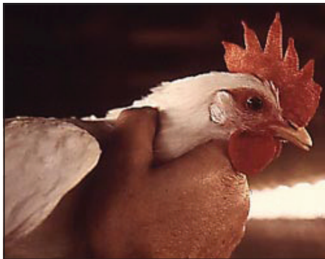
A good quality Leghorn type hen in early production.

Chicks should have 1 square foot of floor space per bird. Put at least 4 inches of litter on the floor of the cleaned, disinfected pen or house. Never place chicks on a slick surface such as cardboard, plastic or newspaper. Wood shavings, cane fiber, ground corn cobs, peanut hulls or rice hulls make good litter. Hay makes very poor litter and should not be used. Stir the litter weekly with a hoe to prevent packing.