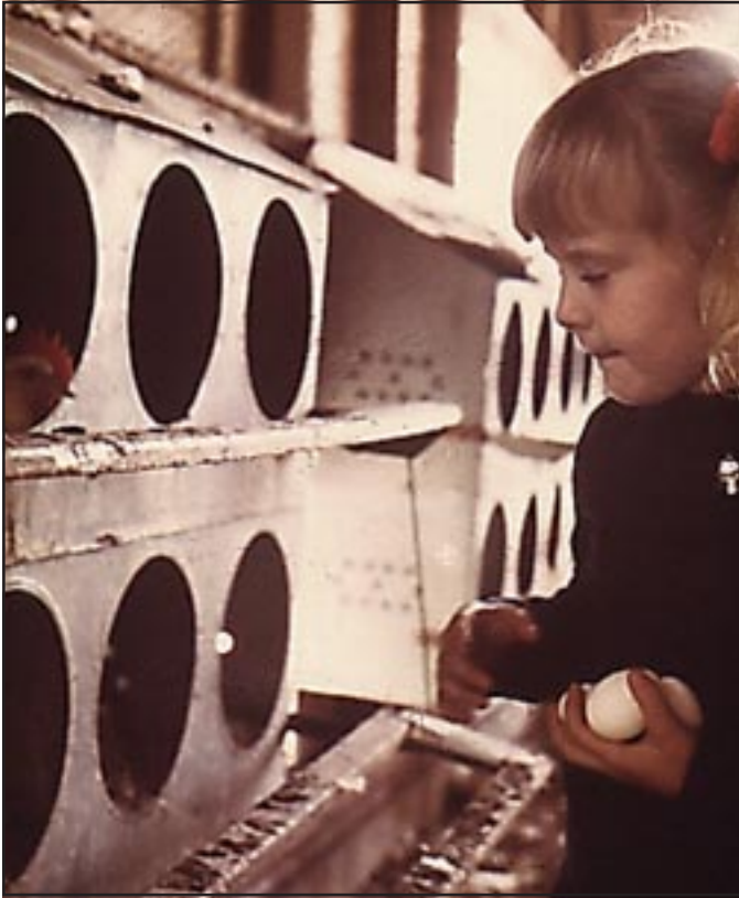
Typical nests for the small laying flock.