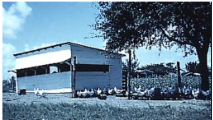
A conventional poultry house for a small flock of pullets or laying hens.

Small laying flocks are generally floor housed or allowed to range rather than kept in cages. Fly control can be a problem where layers are caged. Housing requirements for floor and free-range layers are simple and easy to arrange on most small family farms. Provide hens with 3 square feet of floor space per bird. Protect them from adverse weather conditions and predators. The structure must also protect feeders and be suitable for nests and a roost. Tube feeders and an automatic waterer are recommended for floor layers.