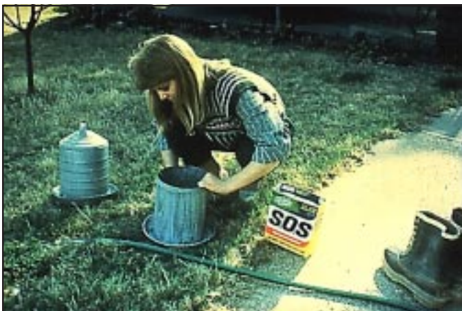
Good health is dependent on clean, potable water.

Clean, potable water and feed must always be available. Add poultry vitamins, at the recommended level, to the drinking water the first week to ensure that birds have sufficient vitamins and to prevent leg problems.