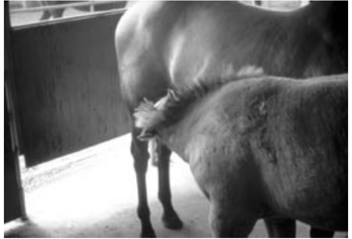
Young foals nurse up to 70 times daily, indicating that they are well suited to small meals.

Before purchasing alfalfa hay, horse owners should ask hay producers whether steps were taken to avoid blister beetles. Blister beetles can be found in other hays, but they are found more often in alfalfa than in other roughage sources.