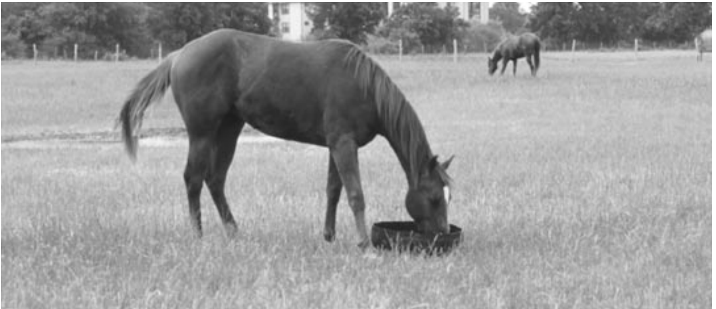
Yearlings will grow at a moderate rate on improved pastures. Supplemental feeding will further improve body condition and gain.

forced exercise should include routine evaluation; in most cases, young horses also will benefit from free exercise. Intense, hard work should be introduced gradually to encourage proper bone remodeling. Sudden changes in stress cause the skeletal system to remodel bone, but it takes time to develop needed strength. If at all possible, conditioning programs should provide adequate free exercise. Some conditioning programs alternate intense work with free exercise and less-intense work on a weekly basis to provide time for bone remodeling to occur. Well over half of Texas farms surveyed reported using forced exercise on an every-other-day basis 12 . Such schedules are supported by research showing the importance of providing adequate recovery time from skeletal strain. 30