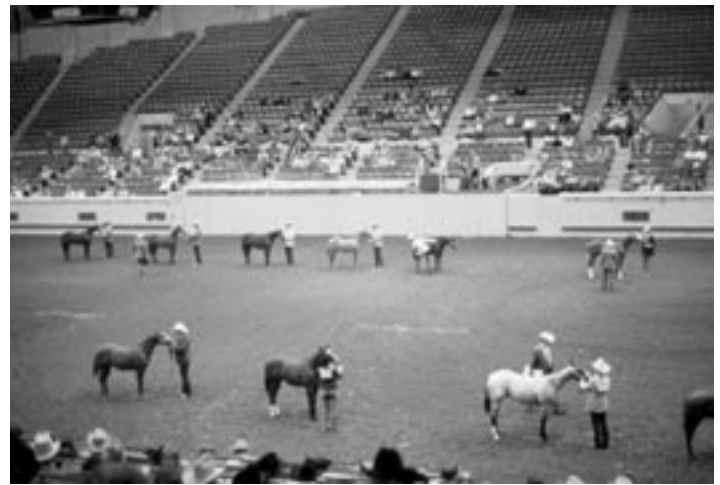
Some young horses must achieve rapid early growth to be competitive.

Sound feeding management, including feeding a balanced nutrient supply, is crucial to improving profit through more marketable and useful horses. With such an approach, problems may still emerge from time to time, but sound early management can be expected to make a difference in young horses' development, regardless of the animals' intended purpose.