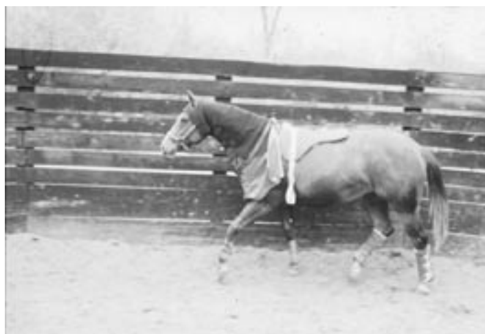
Forced exercise should be conducted on footing that is not too deep.

Routine after-weaning management usually creates an artificial environment of meal feedings. Foals are accustomed to nursing 70 times per day early in life, then typically end up in confinement or semi-confinement, in a meal-feeding situation. While young horses most commonly are fed twice daily, evidence suggests that feeding three or four times in 24 hours actually may improve nutrient absorption while decreasing surges in glucose and insulin. 11 For maximum success and minimal digestive problems, feedings should be evenly spaced, with equal time intervals between each feeding, including from the last feeding of the day to the first feeding of the next day.