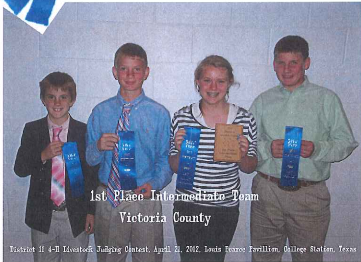
1st Place Intermediate Team Victoria County

District 11 4-H Livestock Judging Contest, April 21, 2012, Louis Pearce Pavillion, College Station, Texas