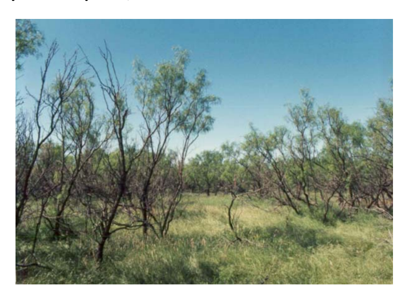
Figure 1. Mesquite treated with a low intensity fire showing the reduced mesquite canopy foliage and very little basal resprouting.

Low-intensity winter fires may be used as a first step for vertical brush sculpting and conversion of mesquite thickets to savannas. Trees partially topkilled by low intensity fires tend to retain foliage in the upper portions of the canopy. Lower-positioned canopy growing points are killed but primary basal support stems are not killed. Overall amount of foliage per tree is reduced compared to preborn levels, yet apical dominance is maintained and basal resprouting is limited (Figure 1). The amount of living foliage that remains on the partially topkilled tree a low intensity fire has direct bearing on whether the tree maintains apical dominance or shifts into a basal sprout mode. Most trees that retain at least 40% of pre-burn foliage maintain apical dominance; below this threshold foliage amount, apical dominance is lost and basal sprouting is stimulated (Ansley and Jacoby 1998).