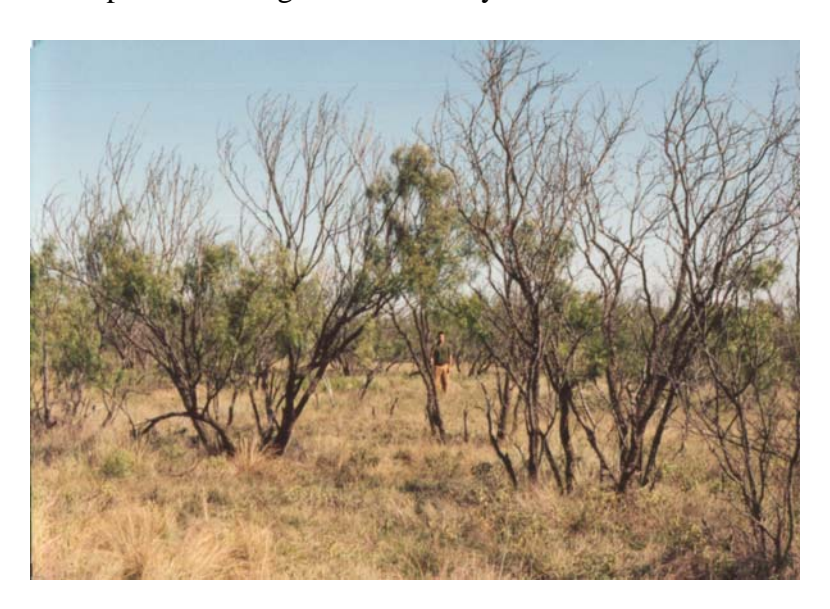
Figure 2. Mesquite treated with 0.38 lb/ac of Reclaim (clopyralid) showing the reduced mesquite canopy foliage and little basal resprouting 4 years after treatment. The person in the center of the photo would not be seen prior to treatment due to thick mesquite foliage.

Low rates of clopyralid alone at 1/4 or 3/8 lb/ac yield moderate mesquite root-kill (20-40 %) so the stand is thinned. However, most surviving plants are not completely and are partially topkilled, retaining some foliage in the canopies (Figure 2). This partial topkilling preserves apical dominance and inhibits basal resprouting (Ansley et al. 2003). Over time, mesquite that survive clopyralid treatments are few-stemmed, have elevated and not basal canopy foliage, and are much less of a problem in terms of competition with grasses than they were before treatment.