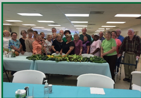
Senior Nutrition Site Recipients