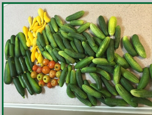
Zucchini, Yellow Squash, Tomatoes, & Cucumbers