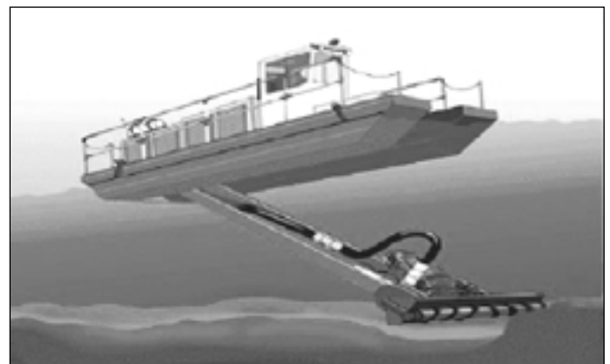
Figure 3. A schematic drawing of the sludge being removed.