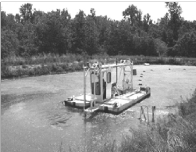
Figure 2. Pumping dredge operating in a lagoon.

This method is most applicable for a temporary structure closure or for operation and maintenance on an operating storage structure. It could be used on a permanent closure if the structure is also dewatered after dredging.