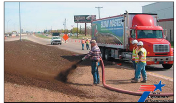
Figure 2. Grass seed and compost being applied as a compost blanket for erosion control and revegetation of a road right-of-way.

New federal storm-water-permit requirements for general construction activities and for municipalities have placed much greater responsibility on construction contractors and on local governments to put in place effective erosion and sediment controls. At the same time, recent research demonstrates the effectiveness of several practices that use compost to stabilize soil, reduce suspended solids and sediment in runoff, reduce chemical loads, and delay runoff onset and volume. Guidelines and specifications for use of compost in erosion and sediment control applications can be found in the Texas Commission on Environmental Quality (TCEQ) reference document BMP Finder at http://www.tnrc.state.tx.us/water/quality/nps/nps_stakeholders.html#bmp%20finderD .