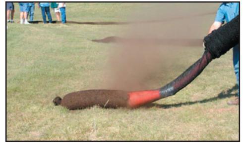
Figure 4. Compost and wood-chip mixture applied in a mesh casing as a filter sock to control runoff and sedimentation.

The Texas Department of Transportation (TxDOT) has used composted dairy manure, feedlot manure, chicken litter, cotton gin burs, yard trimmings, and municipal biosolids as compost blankets for hydroseeding road rights-of-way to control soil erosion from steep slopes (Fig. 2) and as filter berms to control erosion and sedimentation from low- volume runoff (Fig. 3). Recent projects have used filter socks rather than berms, because socks have a greater ability to withstand concentrated flows and to retain sediment (Fig. 4). Another applications at a West Texas municipal landfill uses compost produced from a mixture of poultry manure, sawdust and other wood residuals to control erosion, as a soil amendment and to create a vegetated cover over closed landfill cells.