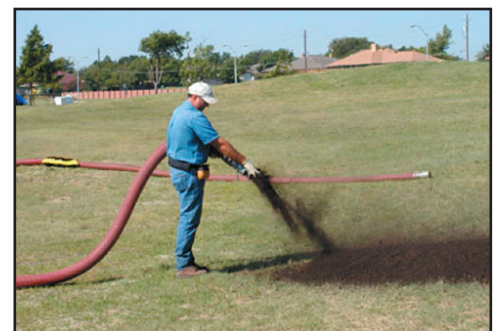
Figure 3. Grass seed and compost being applied as a filter berm to control runoff and sedimentation in a city park waterway.