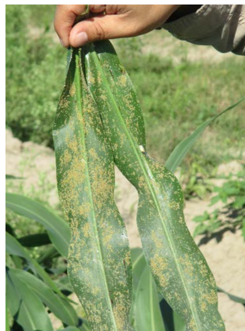
High Sugarcane Aphid populations on sorghum leaves in Cameron County

This week we had a couple of fields sprayed for SCA in eastern Cameron County. It seems that because of the early heavy rains we received the last 2 months and the overcast temperatures that the SCA had a slow start in building its colonies but as of this week we are seeing an increase in SCA populations. With temperatures increasing and fields drying out it seems that the SCA is colonizing more rapidly now and we are seeing an increase in wingless and winged sugarcane aphids. Winged SCA will disperse and colonize fields rapidly. Be sure to monitor and scout your sorghum for sugarcane aphids checking the undersides of the leaves. You need to check all sorghum fields but put more attention to those fields that are in the boot and flag leaf stages . There has also been an increase in army worm populations and you should be mindful and spray for damaging populations when necessary.