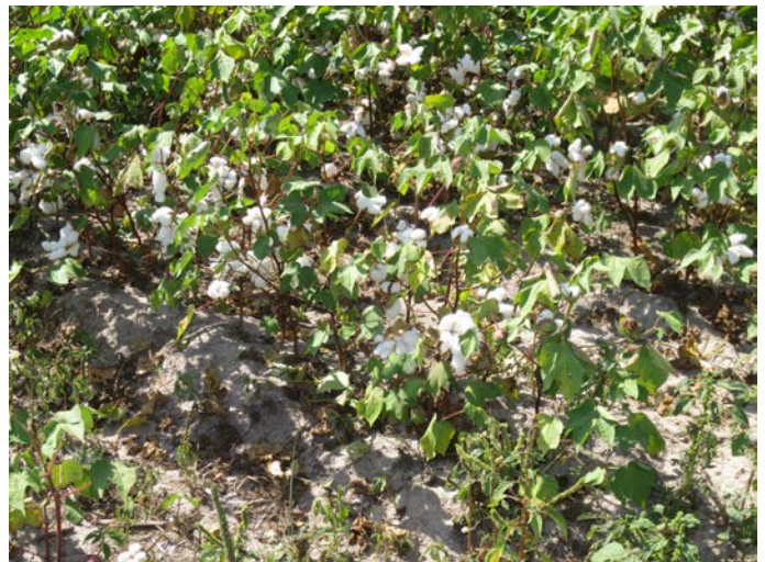
Cotton Bolls opened

As we start heading closer towards harvest, around the Valley the cotton crop has about 50% to 70 % open bolls on average, with later planted cotton at 10% open bolls. Most dry land cotton is maturing fast and has had some of the first fields to receive defoliant. Defoliation of cotton will really start to pick up next week in both dryland and irrigated cotton fields. Some of the defoliant being put out are thidiazuron, diuron and ethephon. This week we saw some Verde bugs out in the fields but were of little concern since the majority of cotton bolls have already matured to unfavorable size that the Verde bug cannot penetrate. Whiteflies are increasing in the Bayview area and spray control might be considered in the next week before harvest time. As for the rest of the Valley the number of whiteflies seen has been considerably low.