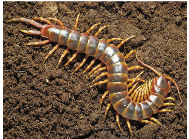
Above is a Centipede