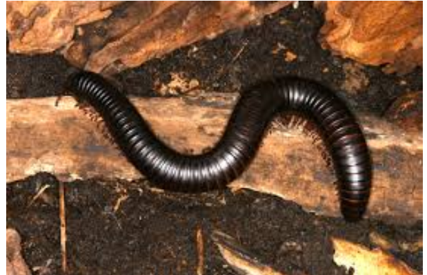
Above is a Millipede

Millipedes or thousand-legged worms are wormlike soil dwellers with two pairs of legs per segment. I found one the other day in my yard and my husband asked if it was poisonous. Millipedes are not poisonous and when disturbed they curl up in a tight ball. They can however produce and release an irritating fluid that can cause allergic reactions to the skin. When being handled they can leave an odor on your hands. Millipedes are slower moving than centipedes and their bodies are round instead of flat like that of the centipede’s body. Centipedes will bite if provoked, and it’s a pretty good bite but not one that requires medical attention. Millipedes and centipedes like to spend their time in moist areas under rocks and tree branches during the day. Both are active at night. Millipedes are known to break down soil by feeding on decomposing organic matter, whereas centipedes will feed on spiders and other insects they kill with their fangs.