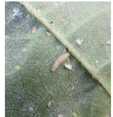
Syrhid fly larvae feeding on whitefly immatures

mouth parts and damage can range from surface feeding to boll malformation to complete fruit loss.