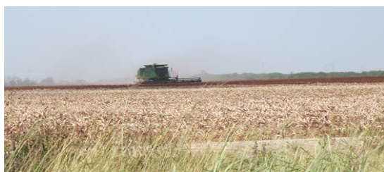
Grain Sorghum being harvested

Many grain sorghum fields being were being harvested this week. In irrigated fields, grain sorghum harvested ranged from 6500 to 8000 pounds per acre. In Combs some growers were harvesting about 7000 to 8000 pounds per acre. In some dryland fields in the Arroyo city area they were harvesting about 3500 pounds per acre. Later planted sorghum in Willacy is at about 10% headed out and is starting to bloom so be on the lookout for midge.