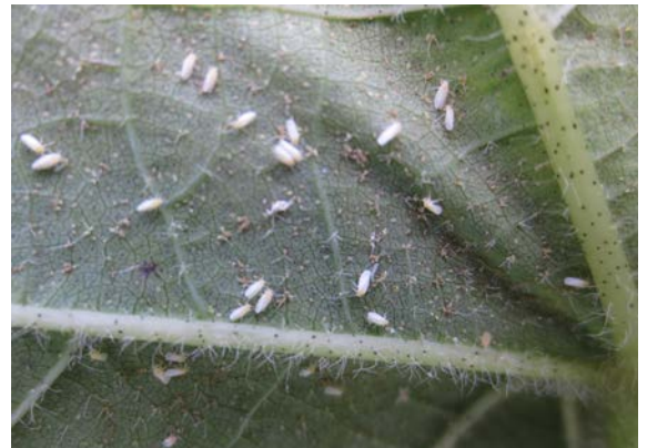
Whiteflies feeding on cotton

The primary pest of concern this week again was the whitefly as fields in the La feria and Brownsville areas were continuing insecticide treatments. Whitefly numbers ranged from 10-40 whiteflies per leaf in most fields with numbers increasing rapidly as leaves begin to glisten with the sticky whitefly secretions.