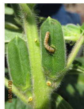
Larvae feeding on Sesame capsule

In sesame whitefly numbers seem to be light and not increasing. Some feeding on the sesame capsules was observed being done by corn earworms but was very minimal. Also in sesame we are observing adult Verde plant bugs in the fields but have not seen any damage from them. The Verde plant bugs tend to be on the lower part of the sesame plant on the underside of the leaves.