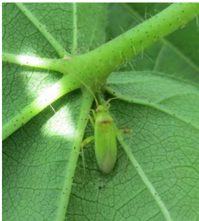
Adult Verde plant bug

Verde plant bugs were on the increase this week as a field in the Rio Hondo area was sprayed when reports of 1 to 2 adult Verde plant bugs per cotton plant were observed. Verde plant bug numbers continue to increase in the Rio Hondo and Arroyo city area. Reports of Verde bugs out in Primera and Combes area were being seen in low occurrences. Verde plant bug adults are about 1/4 inch long in size and are light green in color with long antennae and red eyes. Verde plant bugs feed on squares and small to medium sized bolls. Verde plant bugs will pierce the bolls with their