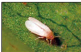
Adult Whitefly.

Insect pressure this week was pretty low. However, it was whiteflies that were a concern this week. Whiteflies were seen in higher numbers this week with both adults and nymphs present so keep a close eye on whitefly in the field. Out