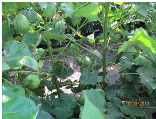
Maturing cotton bolls

Cotton continued to mature nicely and the later planted cotton seems to be catching up in plant height at 1 ½ ft- 2ft while early planted cotton is right at 3ft. Many cotton fields were being irrigated this week as bolls begin to mature and size up on lower half of cotton plants. Early planted cotton was already at 5 NAWF while the majority of cotton was at 7-8 NAWF.