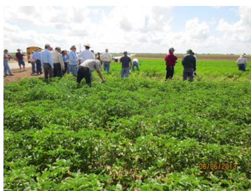
Growers observing Guar field

sesame. According to the Sesaco reps sesame is similar to cotton because it starts fruiting at nodes 6 and 7. They mentioned that early in sesame development armyworms and loopers can be a problem and whiteflies can be a problem later in the season. All in all it was a very informative and valuable field day with much info to take away.