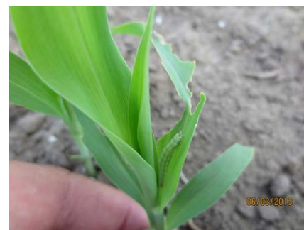
Armyworm feeding on sorghum

Grain sorghum maturing rapidly as heads start to turn red-orange in color. A couple of fields in the mid valley area were reportedly sprayed for midge this week. Midge could be seen in several fields as heads along the end of the field that were still flowering attracted hundreds of sorghum midges. In Willacy county there were 3 to 4 headworms per grain head being reported. In the younger 3 leaf stage grain sorghum armyworms were seen feeding on the emerging plants 1 per every 3 plants checked.