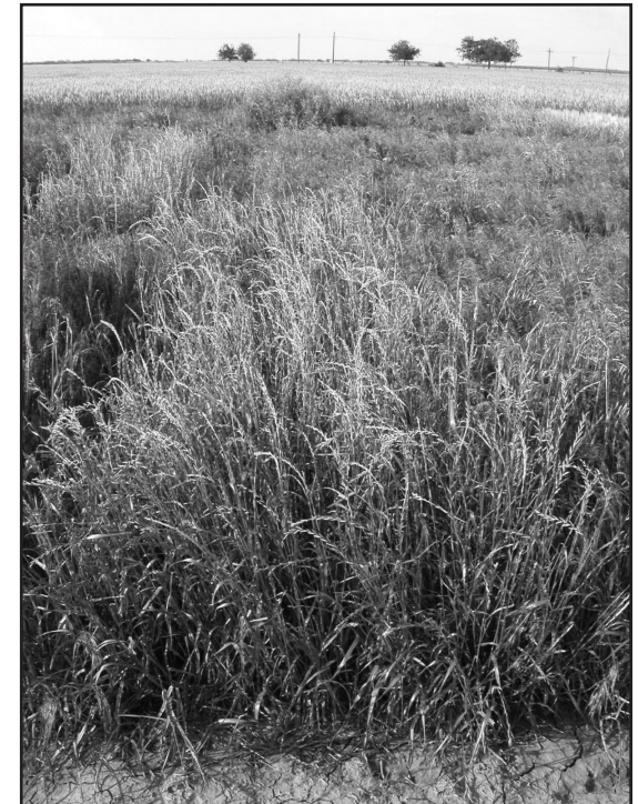
Figure 1. Mature ryegrass in Texas.

Rotating to a summer crop allows you to use non-selective herbicides and tillage in the winter. Timely control of ryegrass infestations in winter-fallow fields can greatly reduce ryegrass seed in the soil. Rotating to summer crops also allows you to use additional herbicide modes of action to control any ryegrass that survives winter control measures.