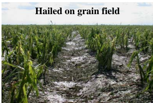
Hailed on grain field

Unfortunately, I need to mention hail damage to these crops. We have an excellent publication that will help assess the loss due to hail. You can find it on our website at http://lubbock.tamu.edu/corn/pdf/cornfreezedamage.pdf . The tables in this publication list the percent of leaf area destroyed at different