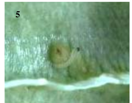
Pink bollworm wart & 1st instar pinkie

Pinkies generally cannot survive and develop in squares that are smaller than a matchhead. Therefore, this August generation of pink bollworm larvae may not be very heavy. But the September field generation could be problematic for late fields.