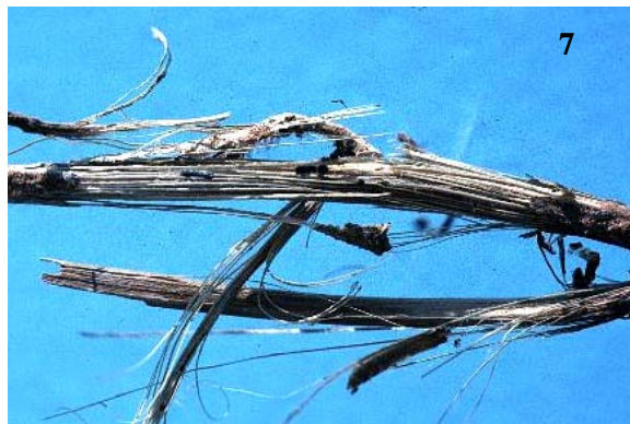
Sclerotinia blight symptoms

We are working on methods to disinfest after coming out of Sclerotinia infected peanut fields. Our work (which is being conducted by Jeffrey Willson at Texas Tech University), which is still in preliminary stages, indicates that it takes 30 min. of soaking in 100% fresh Clorox when the sclerotia are associated with soil particles, to kill S. minor . If the sclerotia are in water or have no soil or other materials on them, then 5 min. of 100% fresh Clorox is sufficient to kill the sclerotia. We have not tested kill of sclerotia with reused Clorox. TW