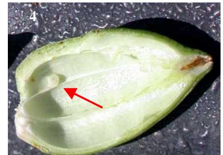
Pink bollworm wart

seeing the same problems developing as we did in 2004 when more acreage was in the sprayed refuge option for resistance management and folks were using trap catches to target applications--- sometimes as many as 20+ in a few fields. With more Bollgard acreage and most refuge acreage in the 5% unsprayed option, pink bollworm sprays are way down.