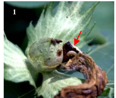
Bollworm under bloom tag

Most fields don't have bollworm problems but caterpillars can be found in the 0-3,000 per acre range. We have been catching large numbers of moths in traps in Dawson, Lubbock and Hale counties for the last month although the Hale County trap catches fell off this week. These are probably locally grown moths. I still do not have any reports of mass movement of bollworm moths out of south Texas. These flights are the ones that usually get us into the heavier infestations. We still have time for these flights to occur so watch out.