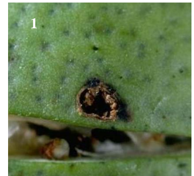
Pink bollworm external boll damage

Pink bollworm numbers in traps are fairly low except in Gaines, Glasscock, Reagan and Upton counties ( see chart ). There are reports that some fields have or will be sprayed in Gaines County this week. These fields will be sprayed based on the pre-boll threshold of 5 weevils per trap per night. There is no doubt that there are traps catching this number and even more but once bolls are present in fields,