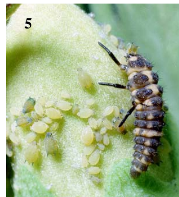
Lady beetle larva and aphids

Natural enemies such as lacewings and lady beetles are doing the job of keeping these slowly developing infestations in check. Any disturbance that reduces numbers of natural enemies or increases aphid survival or reproduction could tip the balance in favor of aphids. With increased bollworm activity and associated sprays, aphid numbers could start increasing. So keep a watch on the situation.