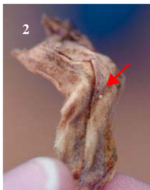
Egg on dry bloom

Bollworms are moving out of corn and into cotton in the northern counties. This has just begun with the leading edge of the egg lay detected this week. Few larvae have been found but more farmers are spraying than should at this time. It is too early in this cycle to tell what will happen and by laying down a pyrethroid now you may be spraying some fields unnecessarily. A few more days wait would give a better measure of the situation. South of the corn country is a different situation. Scattered problem fields exist but no wholesale movement into the area from the Rolling Plains has occurred as I write this. We have too many