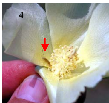
3 day old bollworm

experienced scouts has always been 10,000 small larvae per acre. So those of you that can find the small worms and are still using less than 10,000 per acre---shame on you! I really think this level could be raised to 15,000 small larvae per acre but have not done so. But here is the rub. Since most of the biotic (natural enemies) and abiotic (weather) mortality takes place during the egg stage and the first 3 days of larval life, treatment decisions based on small bollworm larval infestations at or near threshold are probably unnecessary. You should check back in a couple of days or determine if there are enough eggs present to add to the current developing problem. And speaking of eggs---if you are finding 40,000 or more per acre in cotton with 4 or more NAWF, then you probably will have enough survival to cause economic damage from the resulting larvae.