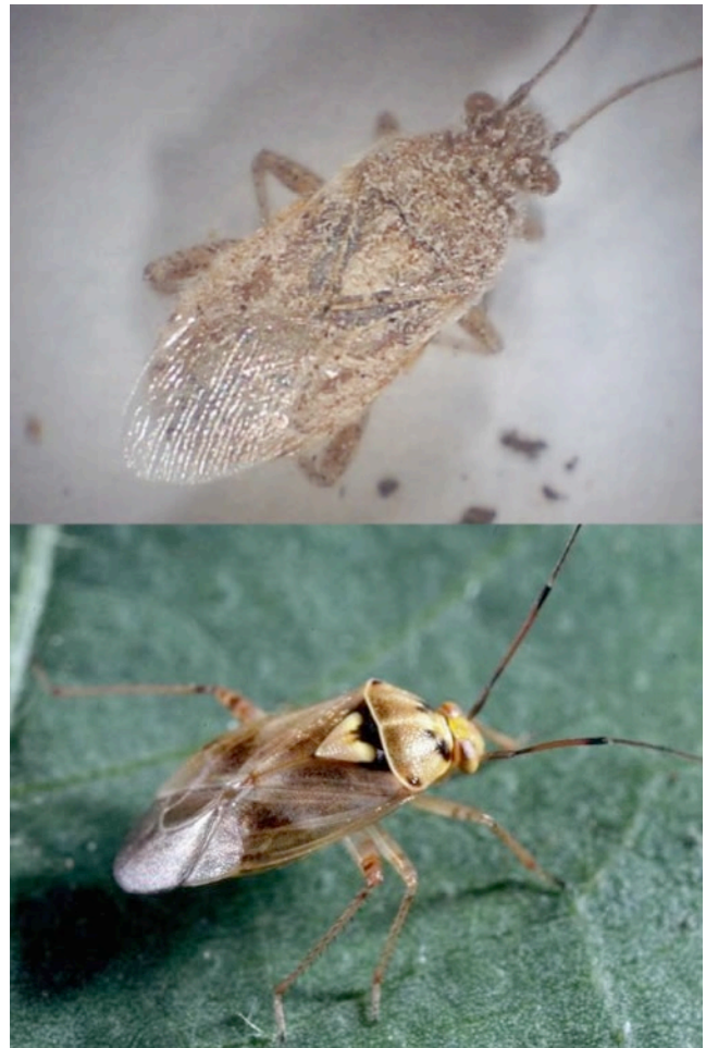
Adult scentless plant bug (top) and adult Lygus (bottom)

Once the cotton reaches peak bloom, research has indicated that beat sheets or drop cloths are a more efficient sampling technique. This is not to say that sweep nets can't be used, but that drop cloths tend to be more reliable. The drop cloth method uses an off-white or black cloth measuring 36 x 42 inches (on 40-inch rows). Small insects are usually better seen on a black drop cloth than a white one. Select a random site in the field and unroll the cloth from one row over to the next row. Mark off 18 inches on each row bordering the cloth and vigorously shake all the plants within that area.