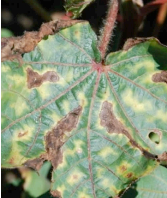
Foliar symptoms of Verticillium wilt

served during boll fill, as the plant cannot adequately transport water and nutrients from the roots. Plants will have a mosaic appearance, and premature defoliation may occur. Significant reductions in lint yield and seed fiber quality can result from severe infections.