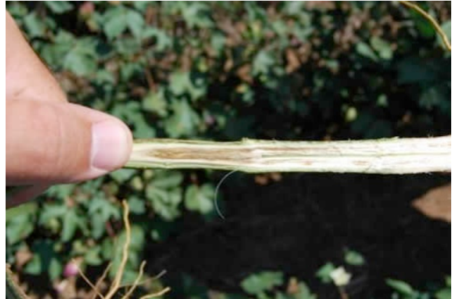
Discoloration of cotton stem caused by Verticillium wilt

Disease severity is closely connected to the population density of the fungus in the soil. You should examine the integrity and color of stems if you think you are dealing with Verticillium wilt. Assays can also be conducted to determine populations of the fungus in the soil. Laboratory confirmation may be required to differentiate from Fusarium wilt.