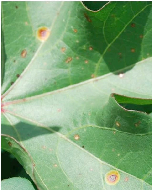
Southwestern rust lesions on the upper leaf surface (photo is from Gaines County)

This disease is more common in the Trans Pecos area; however, it has never been seen on the Southern High Plains. Disease incidence is rather low in Gaines Co. < 1%; however, it is much more severe in areas around Coyanosa.