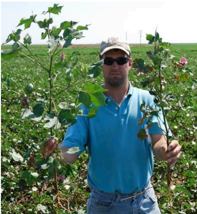
Healthy cotton plant (left) and stunting due to Verticillium wilt (right)

Disease severity is closely connected to the population density of the fungus in the soil. You should examine the integrity and color of stems if you think you are dealing with Verticillium wilt. Assays can also be conducted to determine populations of the fungus in the soil. Laboratory confirmation may be required to differentiate from Fusarium wilt.