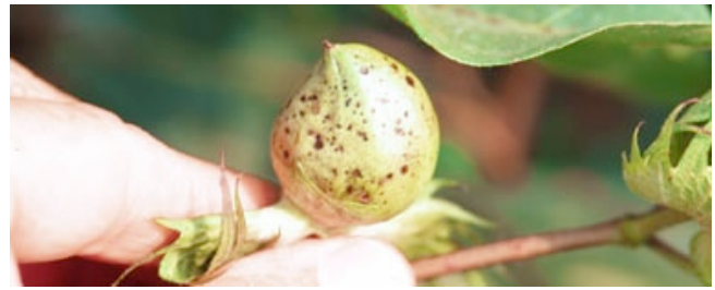
Black sunken lesions on bolls indicate Lygus feeding

Lygus have not been plentiful in cotton since the mid July, but I can pick them up in low numbers pretty regularly. Damage to bolls has not been very noticeable in most fields because Lygus have continued to feed mostly on squares. Once squares are less plentiful, expect boll damage to increase. Avoid basing control decisions simply on damaged bolls. These populations move in and out of cotton quickly and spraying based on damage may not pay off. Try to base your decision to treat on Lygus counts and at this stage in the game, and the appearance of boll damage. When determining damage to bolls, do not base your assessment on external symptoms. If those black sunken lesions do not result in penetration through the carpal wall then neither yield or fiber quality will be impacted. You must open the boll and examine the interior of the carpal wall and lint to determine effective damage. The inner carpal wall will have a small wart and the lock will be stained a light tan color. At this time we do not have strong threshold taking boll damage into account, but Dr. Megha Parajulee is currently working on this.