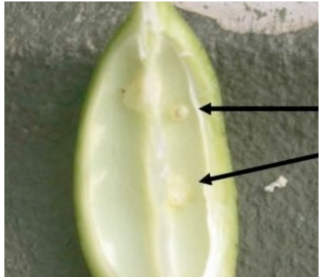
Warts on the inner carpal wall indicates feeding penetration