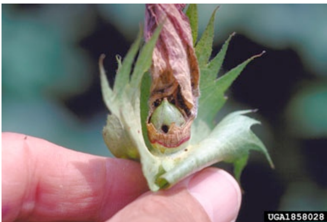
Feeding under the bloom tag can be easily missed