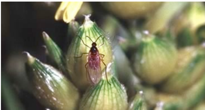
Sorghum midge adult

It is also time to scout for sorghum headworms. This is a complex of caterpillars that feed on sorghum heads, and is usually comprised of cotton bollworm, fall armyworm, and occasionally other species as well. RPP