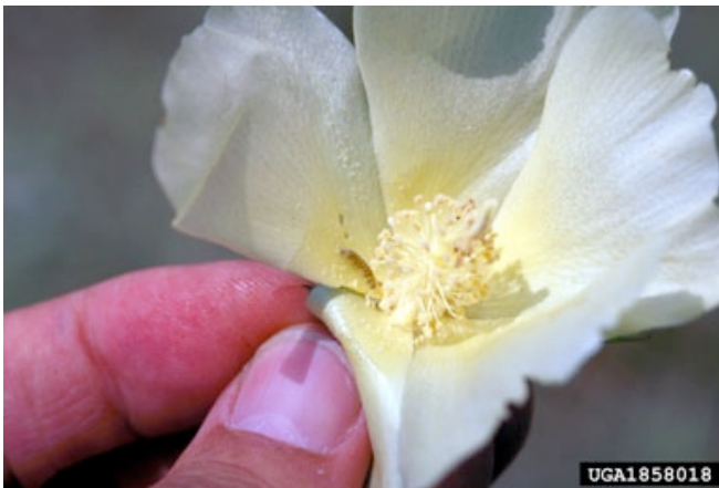
Bollworm feeding on a bloom