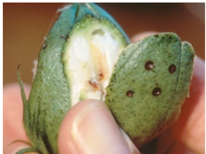
Successful penetration of the carpal wall by Lygus results in stained lint