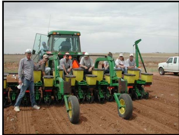
Fig. 1. Planting the small plot variety test in the SDI management study.

Results: The 2005 variety test was abandoned due to a severe hail event on 16 June. However, data from 2002-2004 crop years were used to compare yield and in-season irrigation water value of three popular “picker”, and four common “stripper” cotton varieties under the Normal and High Input scenarios. Lint yields of the stripper varieties (PM2280BG/RR, PM2266 RR, All-Tex Atlas RR, and PM2326RR) tended to reach maximum