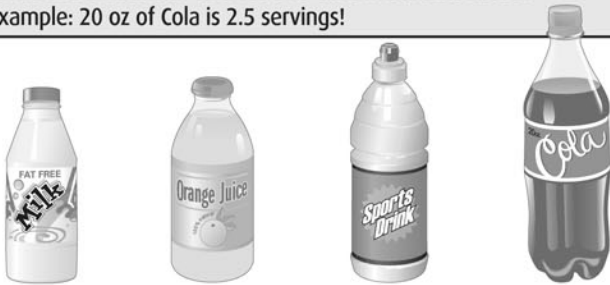
8 oz = 1 serving 12 oz = 1.5 servings 16 oz = 2 servings 20 oz = 2.5 servings

If a label serving size is 1 cup and you drank 2 cups, you consumed twice the amount of calories and other nutrients listed. Example: 20 oz of Cola is 2.5 servings!