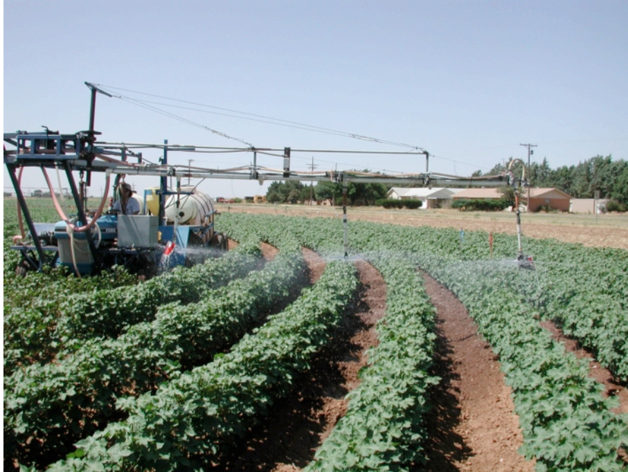
Figure 1. The pivot simulator used to administer treatments of water through three irrigation applicators.