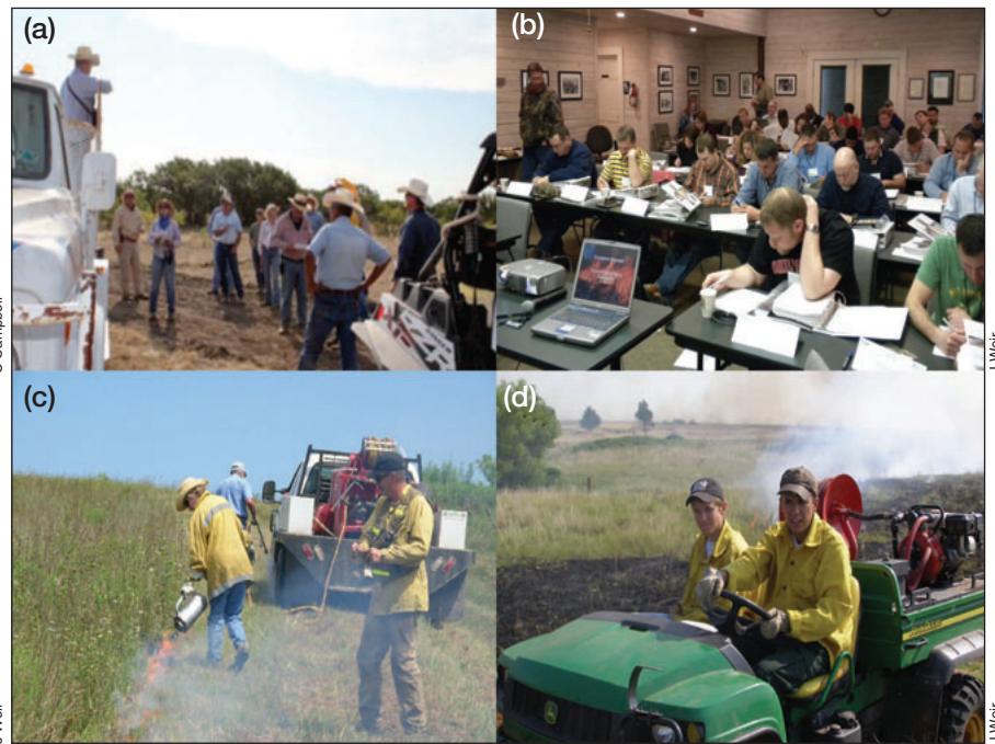
Figure 1. Private citizens are organizing into prescribed burn cooperatives to combat woody plant encroachment in the Great Plains. (a) Members of burn cooperatives pool money and resources, (b) organize training opportunities and workshops, and (c) conduct prescribed burns on each other's properties, while (d) teaching upcoming generations of land stewards the value of fire in grassland conservation.

fire. Moreover, climate warming and intensifying droughts in the growing season have the potential to increase the competitive advantage of juniper over other species (Twidwell et al. 2013b; Volder et al. 2013) and may reinforce juniper dominance even during times of high drought-induced tree mortality (Twidwell et al. 2013b). As a result of these feedbacks, woody encroachment has emerged as the dominant threat to grassland ecosystem services in the Great Plains biome (Engle et al. 2008).