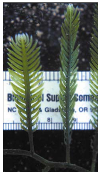
At left: Caulerpa taxifolia showing branchlets (Linda Walters)