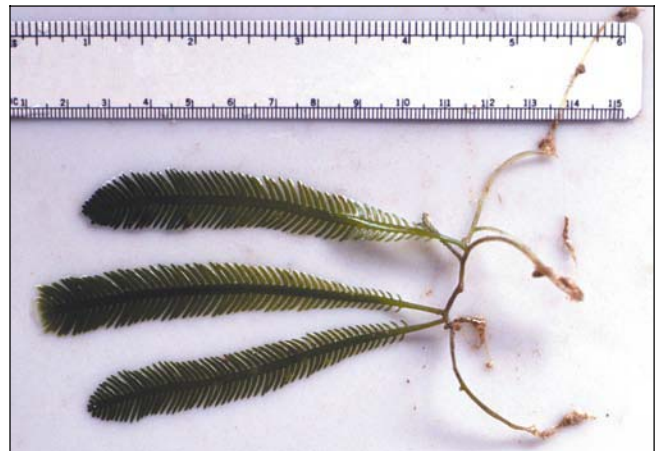
Above: Caulerpa taxifolia showing fronds, rhizome and rhizoids (Linda Walters)

All species of Caulerpa have upright fronds (blades) that are spaced out along a robust, creeping runner (rhizome). Fine, hair-like rhizoids branch off the rhizome. The rhizome and rhizoids grow underneath sand grains or adhere to rocks. The Mediterranean and tropical strains of Caulerpa taxifolia such as those founding Florida have featherlike, grass-green fronds with flattened branchlets that are 0.6–1.0 millimeters wide (0.02–0.04 inches). When mature, the branchlets are separated by about 1 millimeter (0.04 inches), and they are pinched at the tips and at the base where they attach to the midrib.