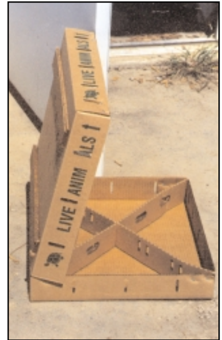
Box for shipping pet turtles.

Current export markets for baby pet turtles show little sign of dramatic expansion over the next