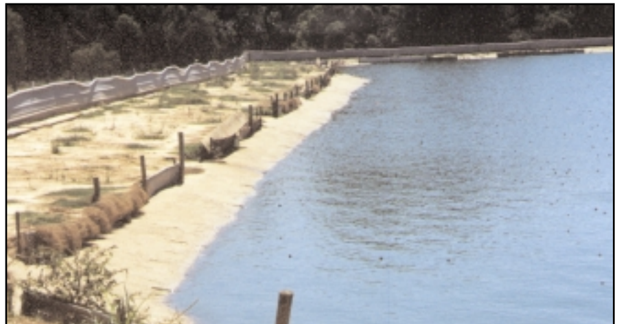
Turtle production pond, with sandy nesting area and perimeter fence.

Brood turtles are typically fed floating catfish feed, although some producers use specially formulated rations. Commercial turtle diets typically contain 22 percent protein, with alfalfa meal or other plant products as a protein source. Vitamins A, D and E are important nutrients; if formulated feeds do not contain enough of these vitamins turtles must be offered green, leafy vegetables.