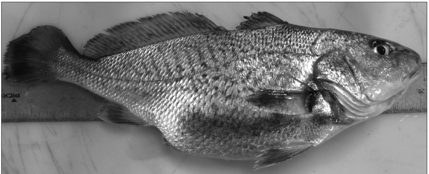
Figure 1. A gravid female Atlantic croaker with free-flowing eggs 72 hours after injection with a salmon Gonadotropin-Releasing Hormone analogue implant.

Wild-caught Atlantic croakers were first induced to spawn with hormones (chorionic gonadotropins) in the 1970s. Injections had to be repeated many times for each female over a period of days or even weeks, and only 25 percent of females produced viable eggs using chorionic gonadotropins. Therefore, induced spawning, and the reproduction of croakers in general, were neglected until recently when other hormone treatments became available. The use of hormone implants containing salmon Gonadotropin-Releasing Hormone analogue (sGnRH a ) has been successful (Fig. 1). A single 75-μg sGnRH a implant injected under the skin when water tempera-