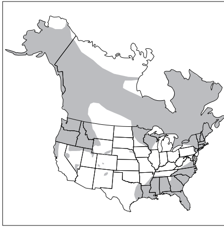
Fig. 2. Distribution of the river otter in North America.

the belly, where it is usually lighter, varying from brown to almost beige.