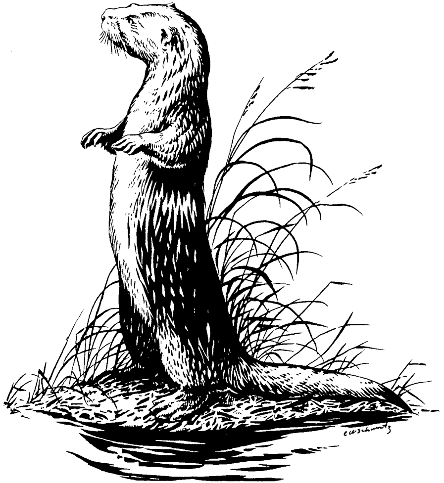
Fig. 1. The North American river otter, Lutra canadensis