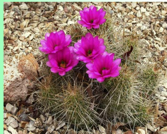
Strawberry Cactus ( Echinocereus stramineus ) an endangered species in the Franklin Mountains